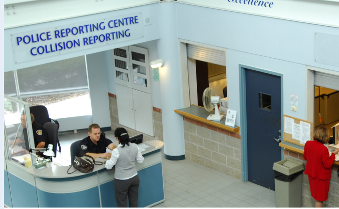
Halton Regional Police Service Police Reporting Centre officers assist members of the public with a wide range of inquiries.